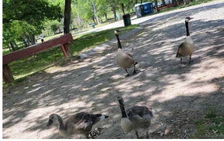
A beautiful day at the pond for Beechwood residents—watching the ducks, sharing stories, and enjoying each other’s company with a picnic basket and blanket. The afternoon was filled with laughter, conversation, and the simple joy of spending time together in the beauty of nature.