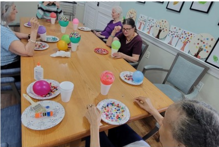
Beechwood residents enjoyed a fun and colorful craft session, creating unique button-covered balloon decorations. The activity encouraged creativity, conversation, and plenty of smiles as residents showcased their artistic talents.