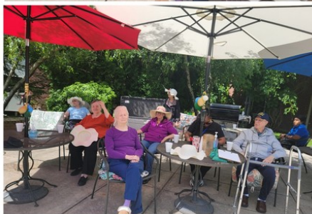
Our Beechwood Memory Care residents enjoyed beautiful weather in the courtyard, playing a friendly game of cornhole, soaking up the sunshine, and spending quality time together. Outdoor activities like these encourage movement, social connection, and joyful moments while enjoying the fresh air and warm weather.