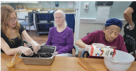
A Sweet Trip Down Memory Lane This month, our Memory Care residents enjoyed a delightful activity that brought back cherished childhood memories by making their own homemade Cookies & Cream and Vanilla ice cream. From mixing ingredients to sharing smiles and stories, the experience was filled with laughter, nostalgia, and the simple joy of creating a timeless treat together.