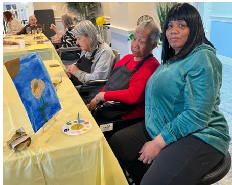
Sip & Paint with Beechwood residents and their families