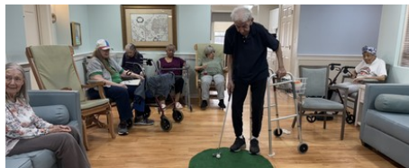
That sounds amazing! Mini golf is such a fun and engaging activity—especially great for memory care residents since it's both social and low-pressure.