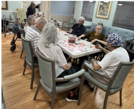
Some of our competitive, yet friendly activities among friends include playing games and bowling.