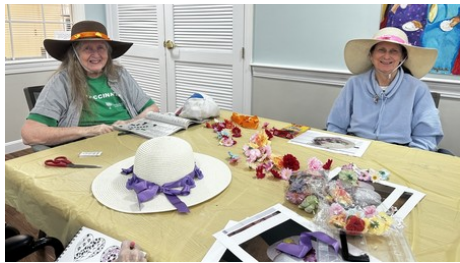
Hat Making Day in Beechwood! Some of the residents showing off their amazing creativity. Who knew felt, flowers and flair could go such a long way?