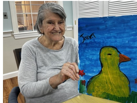
On our memory care unit, some of our residents enjoy painting, so today the residents decided to paint ducklings from their last field trip.