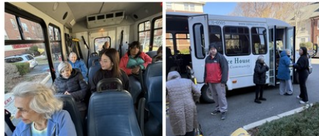
Bus trip to Fresh Pond Reservation.