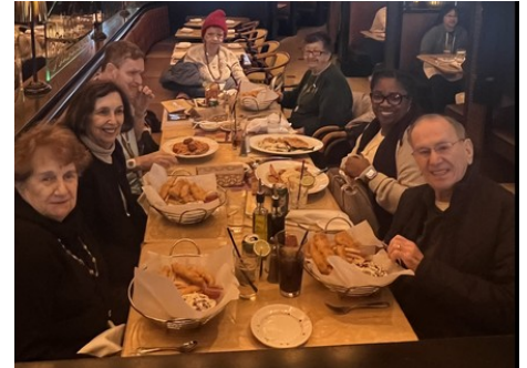
Residents' lunch trip to the Cheesecake Factory and Ken's steak house.