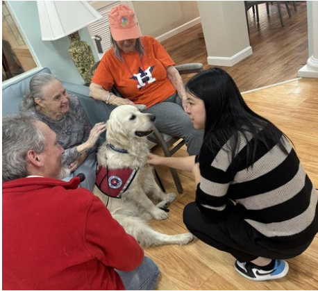
On our memory care unit, the residents had a visit from one of their furry pet friends and outdoor walk.