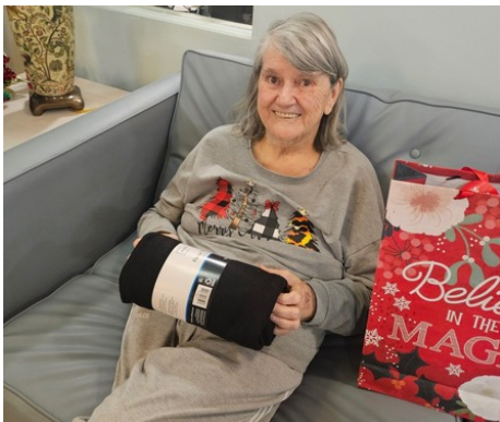
Beechwood residents were so happy and pleased with their holiday gifts from Providence House.