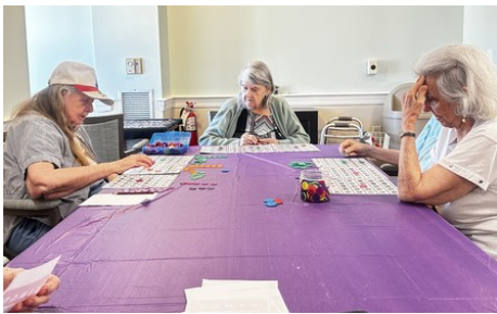
It's Wednesday and we know how important bingo is to our residents in Beechwood community.