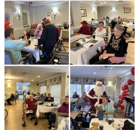
This year's Residents' Holiday Party: We had a surprise from Santa; he stopped by with gifts and spread some love in the community.