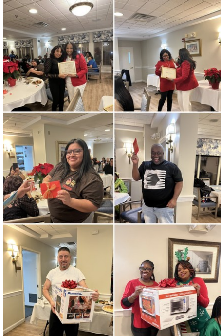
Providence House Staff Holiday Party and gifts. The staff enjoyed the different cultures of food and music.