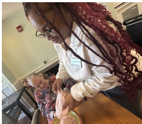
Baking group on our memory care unit