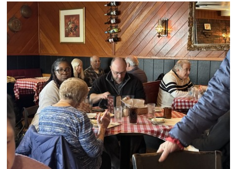
PH residents enjoying one of their favorite places to eat, Greg's Restaurant. The steak was on point, nicely cooked and served just the way they like.