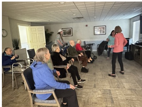
Our community is blessed to have Live Interactive Theater by Debi Block. Every month she showcases someone famous from the '50s to '70s. Our residents love it.