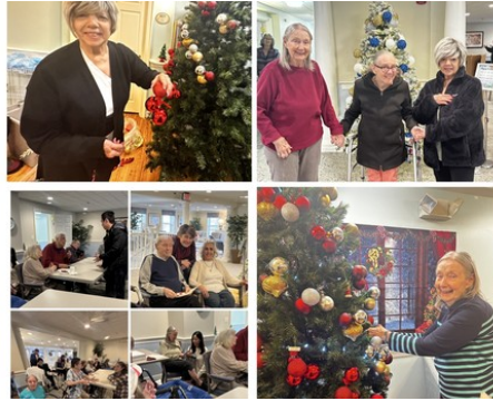
Thank to the Reclaimer College Church for visiting our community and bringing our residents gifts.