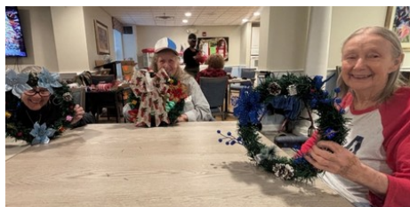
Some of our holiday crafts that our Beechwood residents did this month