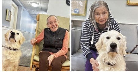
Our furry friend came to visit our residents in memory care unit.