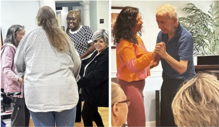
Ballroom dancing with residents and staff