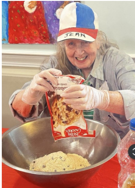
Baking chocolate chip cookies to get in to the holiday spirit