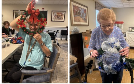
It's that time of the year. Here at PH, our residents love to create a wreath to hang on their door. Happy holidays from us to you.

2025 is the Year of the Snake and to celebrate another brand new Lunar Year, LEGO will be releasing another range of Chinese culture-based models. The first of these is the usual Gift With Purchase celebrating this year's Zodiac animal of 40707 Year of the Snake. But at the CIIE in Shanghai, LEGO has officially presented three brand new LEGO Chinese New Year sets that will all go on sale at the start of 2025.