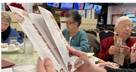
Residents' lunch trip at Joyful Garden