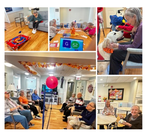
Beechwood residents participating in daily activities, mentally and physically.