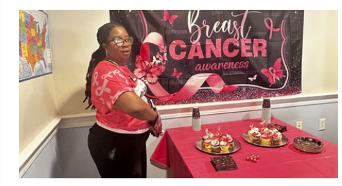
Breast Cancer Awareness lecture