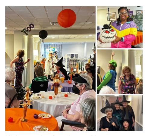
Halloween bash and pumpkin contest at PH.