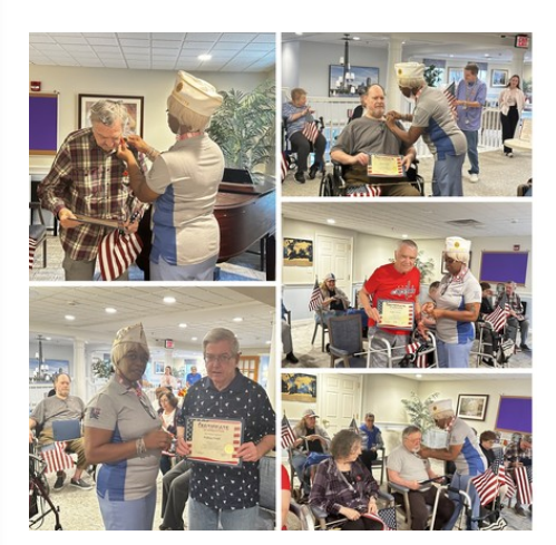
Honoring our veterans, we thank you for your service.