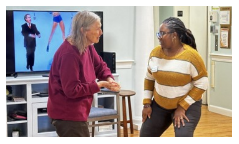
It's music and movement time.