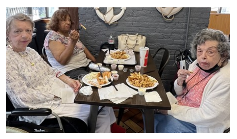
PH Residents lunch trip to Clam Box.