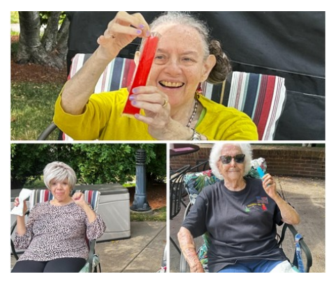
When it is hot, why not cool down with some ice pops outside in PH's beautiful courtyard with friends?