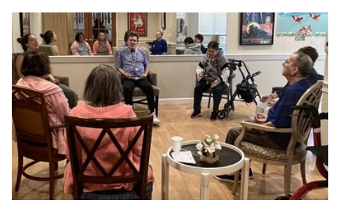
PH residents meditating and relaxing their minds and bodies.