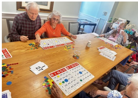
It's bingo time, by residents' request. It's too hot to go outside for a walk.