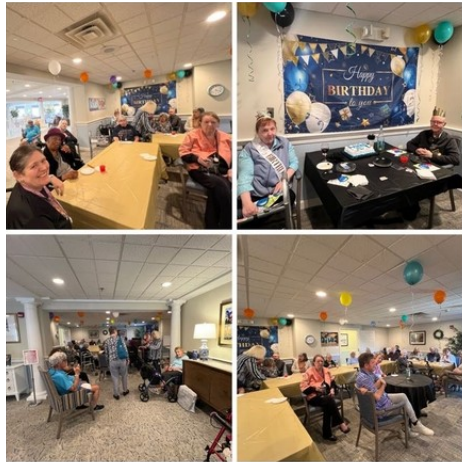
Resident monthly birthday celebration party in our Community Center.