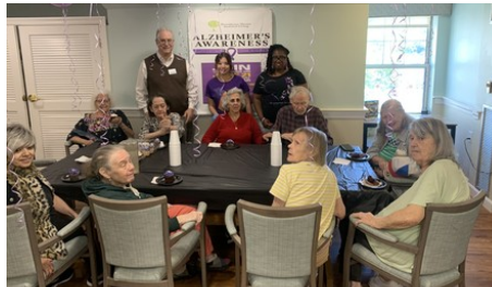
Every June the Providence House Staff and the Beechwood residents are actively involved in activities and walks in the fight to end Alzheimer's disease.