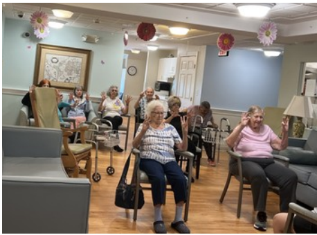
Beechwood residents, getting their day started with some morning fitness and listening to smooth jazz music.