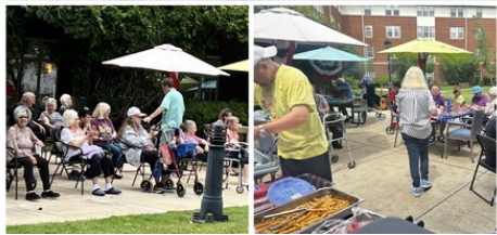
Residents enjoying their 4th of July Party outside the PH courtyard.