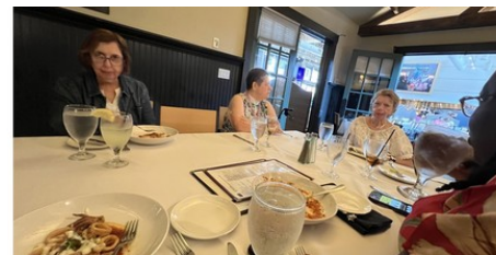
Residents Lunch Trip at Novara