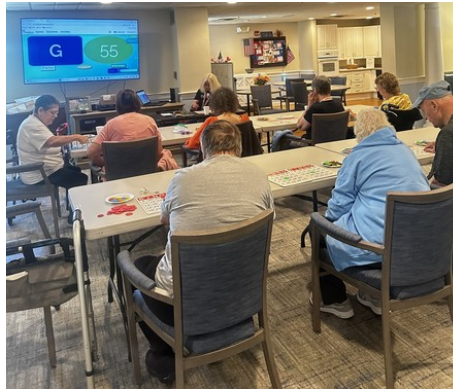
PH residents enjoying their favorite activity-It's bingo time.