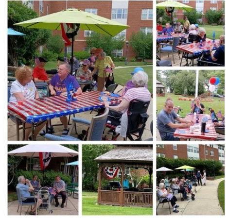
Celebrating Fourth of July at Providence House inside our courtyard. Residents having a lot of fun, socializing, and playing games with each other.