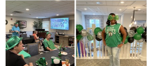
Celtics championship celebration party. Residents and staff celebrating the team who won the most NBA championships.