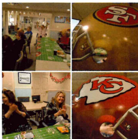
Super Bowl Sunday night watch party at Providence House.