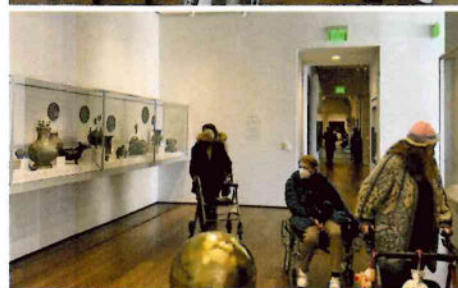
We had a very educational tour at the Harvard Art Museums in Cambridge, MA.