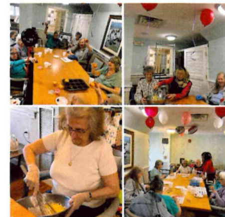
It's our Valentine's Day!!! We had special bingo game with prizes for the winners, we baked delicious cupcakes and the secret ingredient is always love. Beechwood.