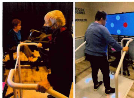
Providence House residents in the gym working out on the balance machine.

Women's History Month 2024 is coming up in March. During this time, we encourage you to take time with your team to reflect on and celebrate the achievements of amazing women throughout history. Women's History Month is also a time to recognize gender-based inequities that still exist today.