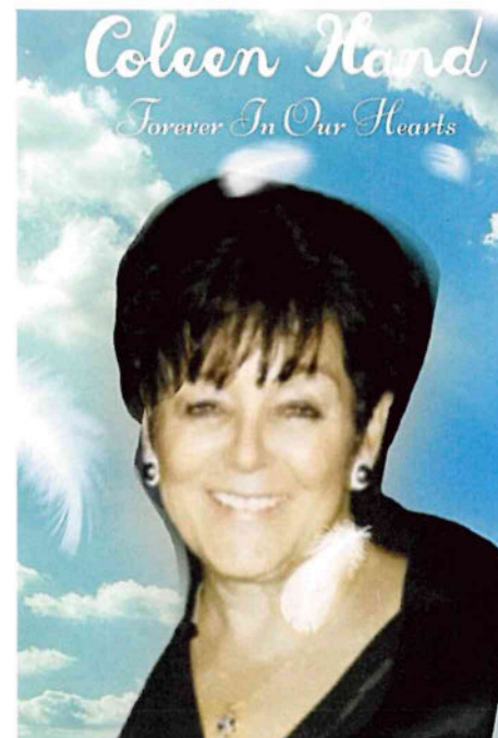
This month we celebrated the life of our beloved friend, co-worker and dedicated staff of Providence House who passed away.