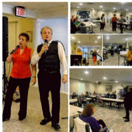
It's our monthly residents' birthday celebration with live entertainment performance, karaoke and happy hour. We all had a blast.