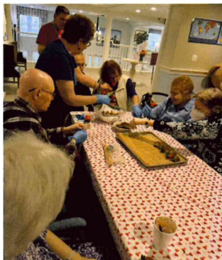
PH residents making a Valentine's Day special, strawberry-covered chocolate. It was delicious.