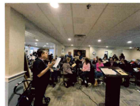
Residents pay tribute to our beloved nurse who passed away.