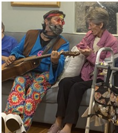
Special performance by Kalifornia Karl celebrating the '60s, singing Elvis and The Beatles!